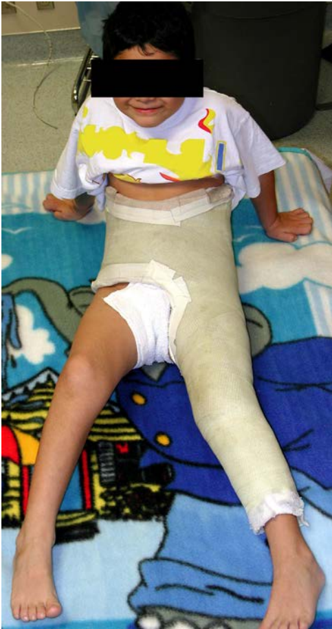
Hip spica cast for left hip Legg-Calve-Perthes

The healing process continues for a year or two and during this slow healing phase, the child is kept out of sports or vigorous activities. In rare cases, even with the